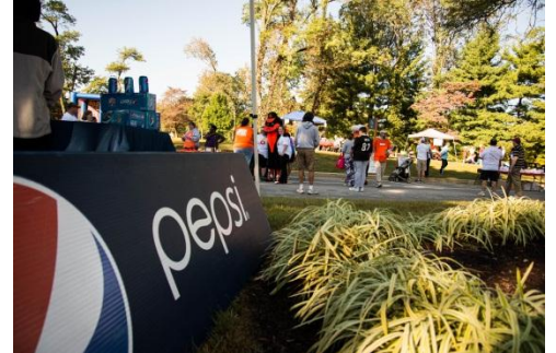
Pepsi Beverages Company proudly sponsors and donates bottles of water for Walkabout Abilities participants every year.